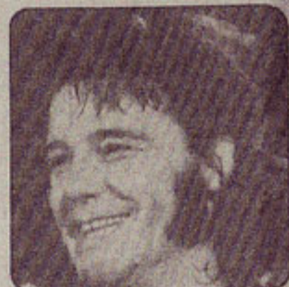
ALEX HARVEY: new album next month

THE RISE AND RISE OF SCOTTISH ROCK — PAGE 8.